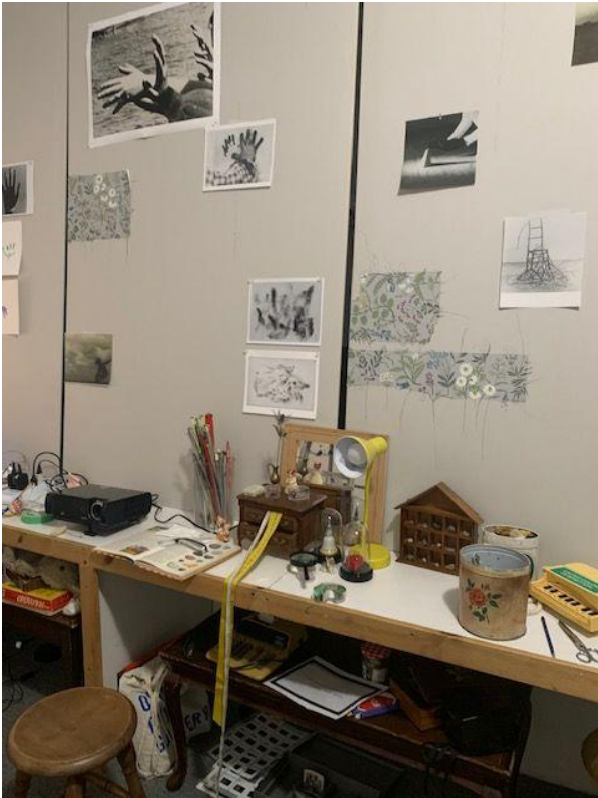
A view of the performance space.

30 Bridgman Avenue, Toronto. There is information here about getting to the theatre.