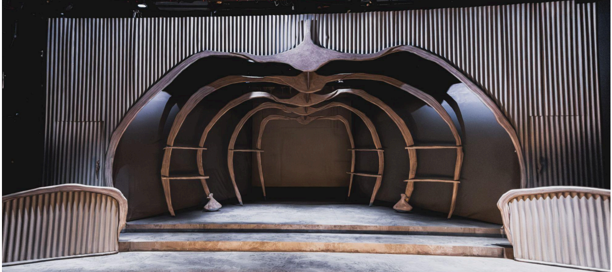
Set Design by Andy Moro

During intermission, all the items from the shelves and counters are removed from the set and images are projected onto it so that the rib bones blend in with the trees of a park.