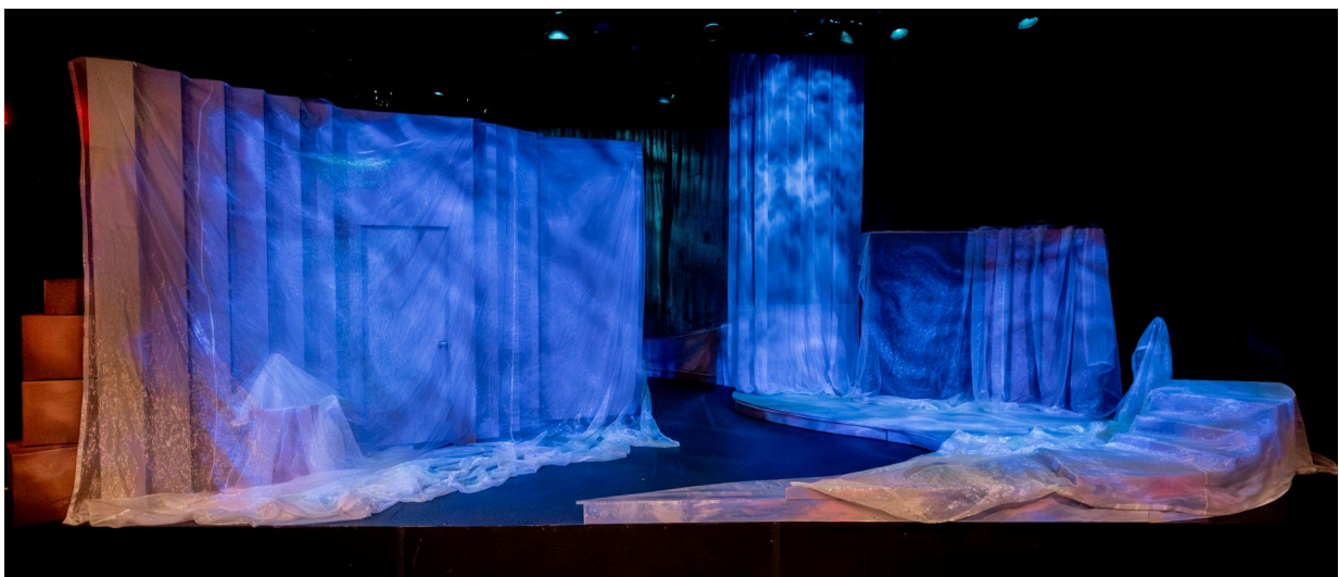
Set Design by Jawon Kang

At the beginning of the show the wall, the taller platform, and the short staircase are draped in large sheets of see-through fabric. These coverings are removed in the first few minutes of the performance.